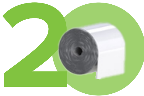
PSA Tape *PSA tape is used to align and hold panel in place until self-tapping screws are installed