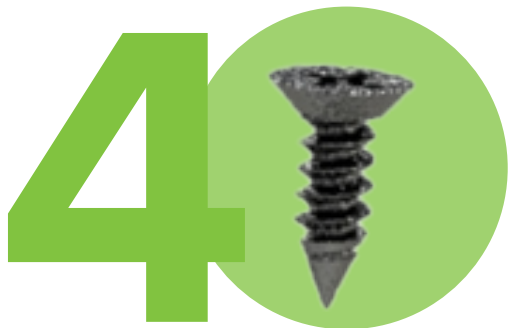
Screws 8" x 0.1"