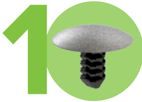
Small Tree Clip 0.343" x 0.712"